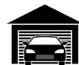
Opened Garage door